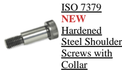
ISO 7379 NEW Hardened Steel Shoulder Screws with Collar