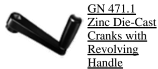
GN 471.1 Zinc Die-Cast Cranks with Revolving Handle