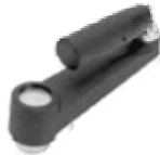
MH/MRS Nylon Plastic Cranks with Retractable Handle