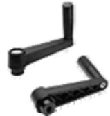
EN 570 Technopolymer Plastic Cranks with Revolving Handle