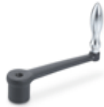
DIN 469 Cast Iron Straight Crank Handles