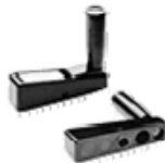
EN 510 Phenolic Plastic Control Handles