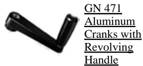
GN 471 Aluminum Cranks with Revolving Handle