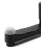
EN 670 Ergostyle® Technopolymer Plastic Cranks with Revolving Handle