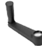
MH-MEP Nylon Plastic Economical Cranks with Revolving Handle